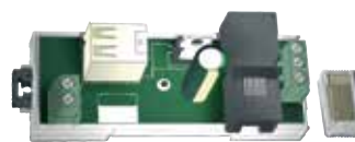
Flex EXU -interface card