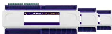
Flex UI16, Flex Combi 21 and Flex Combi 32.

Ouflex device I/O points can be expanded with separate Flex expansion units. Ouman has commercialized three different types of expansion units (Flex UI16, Flex Combi 21 and Flex Combi 32). System can be added with Flex EXU -interface card for the local I/O expansion.